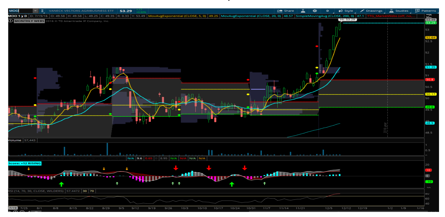
MOO Weekly Chart