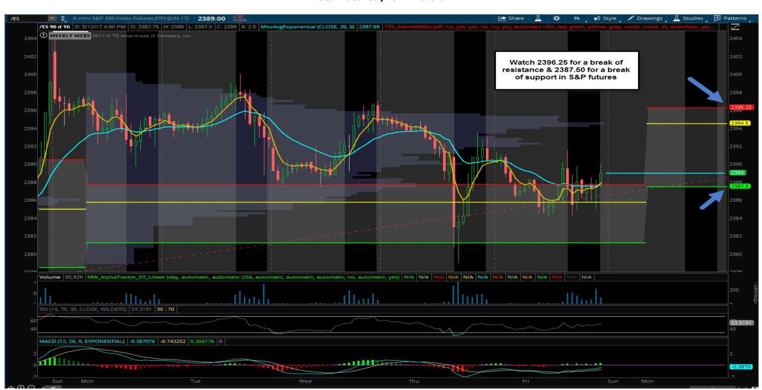
S&P futures /ES 1hr chart

Next week in US Economics we get Empire Manufacturing, Housing Starts & Building Permits, Industrial Production, Mortgage data, Philly Fed Business Optimism, and the Leading Index data. In earnings reports, HD, TJX, DKS, TGT, CSCO, WMT, AMAT, CRM, BABA, GPS, and DE are among the top companies reporting.