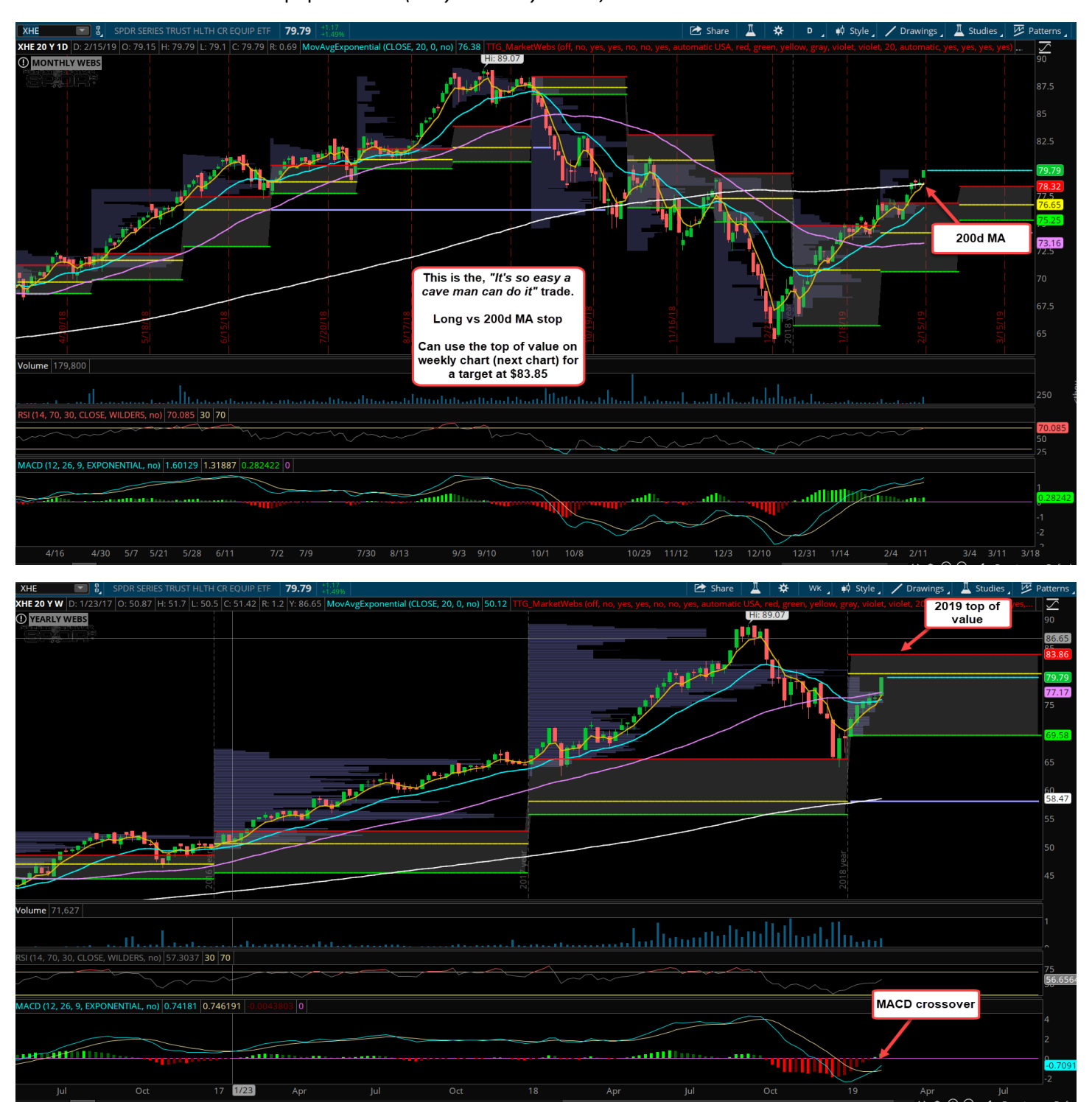
XHE - SPDR S&P Health Care Equipment ETF (daily & weekly charts)

A note about option activity – some I will post on the charts. My job is to find the trend & setup before we see call buying, because much of it is late, and when you see it, you often have to chase. That said, some are spot on and make for good trade ideas if the technical line up.